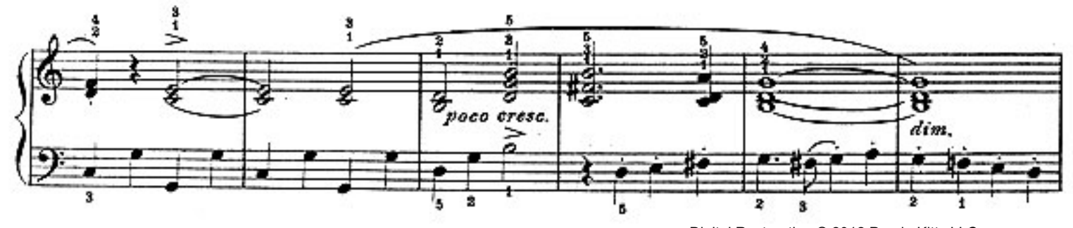
Digital Restoration © 2012 Purple Kitty LLC